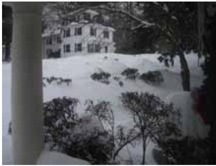
Winchester, MA 2011

If May is here, can spring be far behind? New England had more than its share of snow this year, and I spent many days staying home and drinking tea. We laughed after the first 6 feet of snow, and laughed even harder when we had 2 three-foot snow storms a few days apart. Needless to say, the yard is full of plants damaged by the ice and snow. But then again, a few weeks of sun will probably perk up some of the crippled, and they will be as good as gold again.